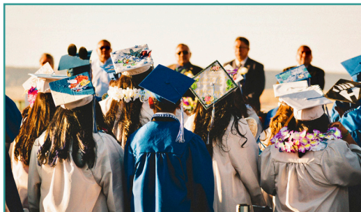
Hopi Jr/Sr High 2023 Graduation