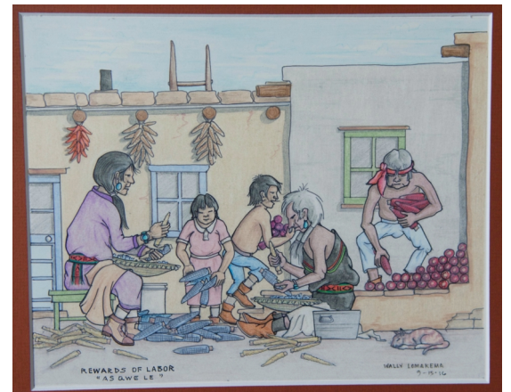
"Rewards of Labor"