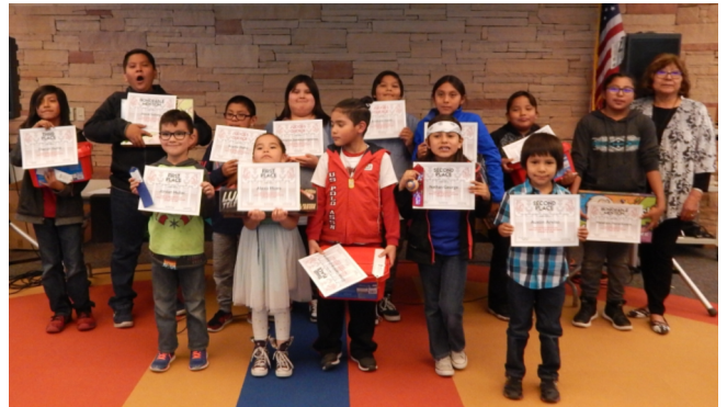
Proud award winners and future Hopi college students