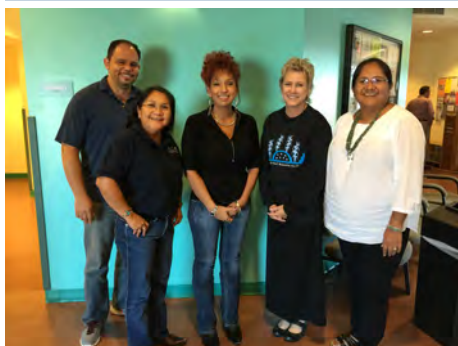
Meet the new Executive Committee.