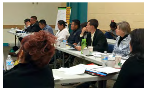
HEEF members are challenged with creating effective strategies for the future.

throughout the year. The committees all share the mission of fundraising and growing the fund that supports Hopi education into perpetuity.